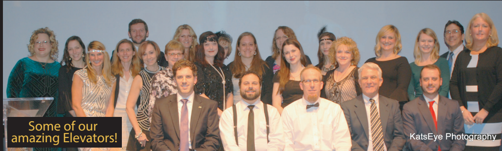
Some of our amazing Elevators!